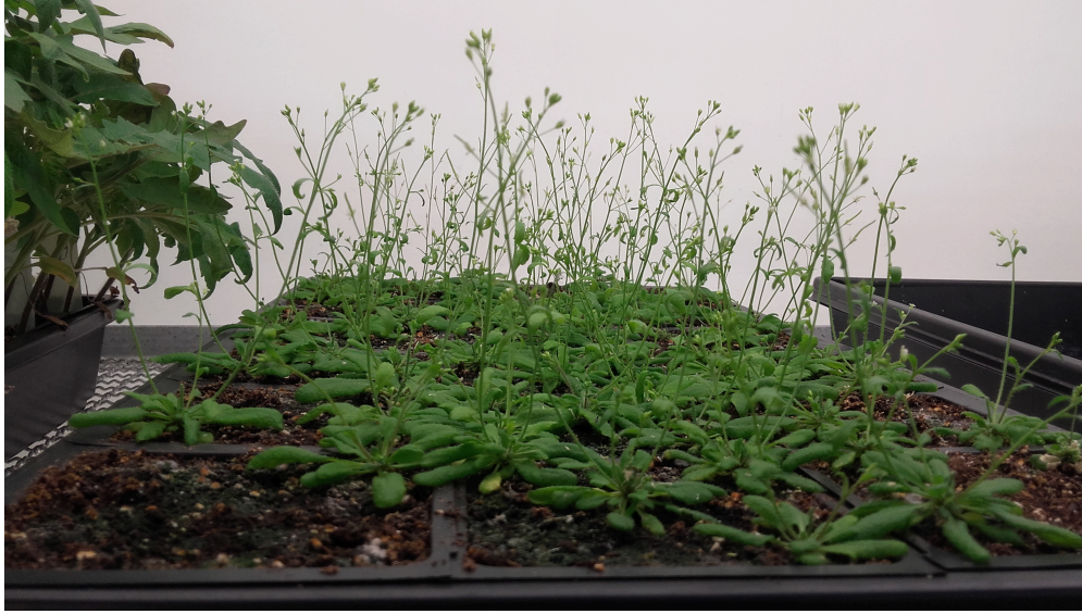
4 weeks old Arabidopsis thaliana plants