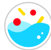
Plate cell - SELEX

dx.doi.org/10.17504/protocols.io.8g6htze