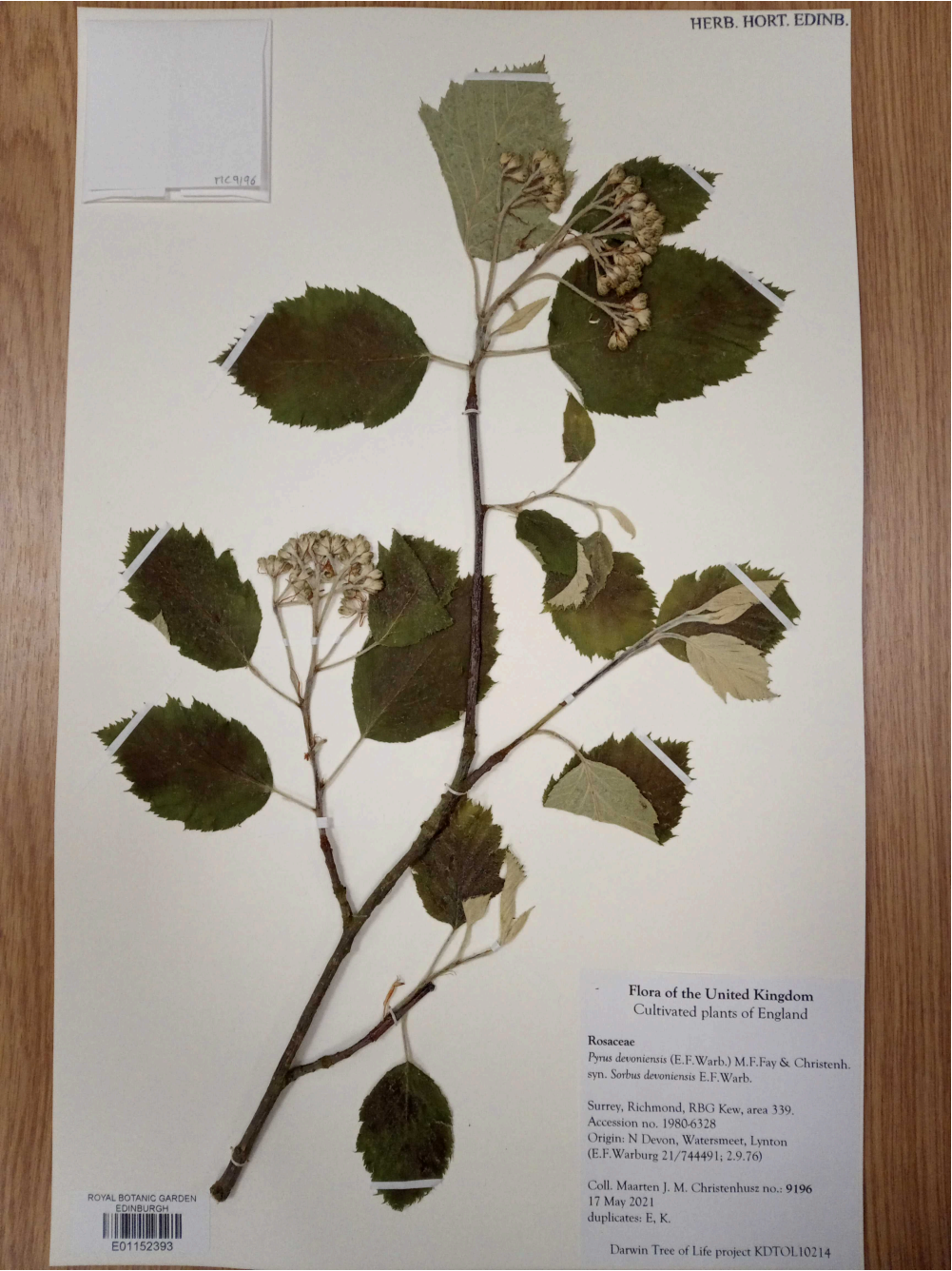
Mounted specimen ready to be laid away in the RBGE herbarium