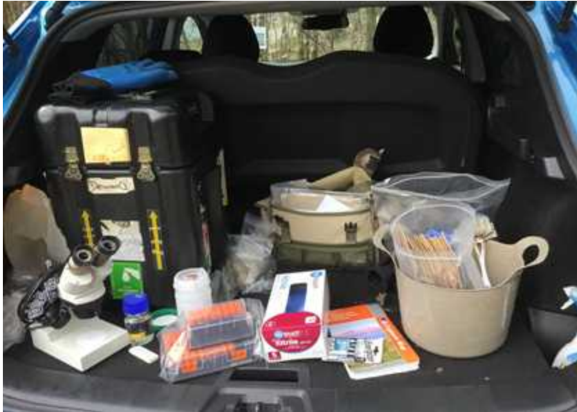
Sampling equipment ready for field work

Samples for DToL are either a) processed in the field, or b) sent to a Genome Acquisition Lab for processing. The Genome Acquisition Lab can provide collectors with FluidX tubes or sample containers, and with printed and electronic datasheets to associate specimens with collection vessels. The Genome Acquisition Lab can also provide equipment and specimen containers for DNA barcoding, genome size estimation and herbarium vouchering.