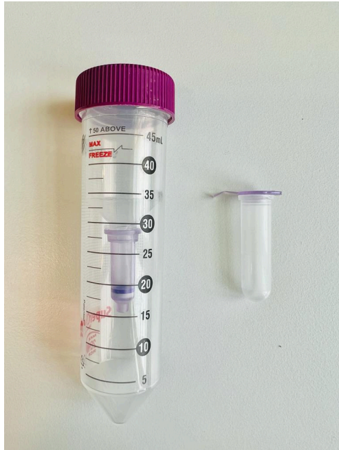
Binding apparatus containing MinElute column and 2 ml collection tube with lid.