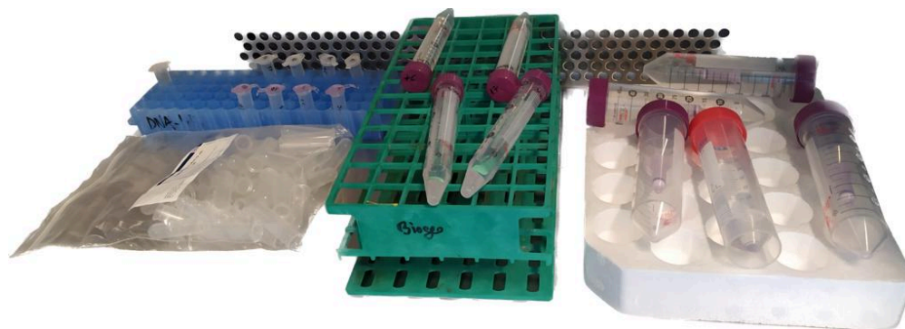
Example of a set up for overnight UV.